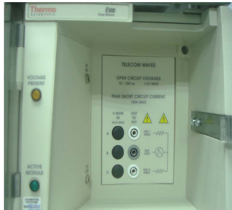
10/360 \mu s MODEL(2.1.2)