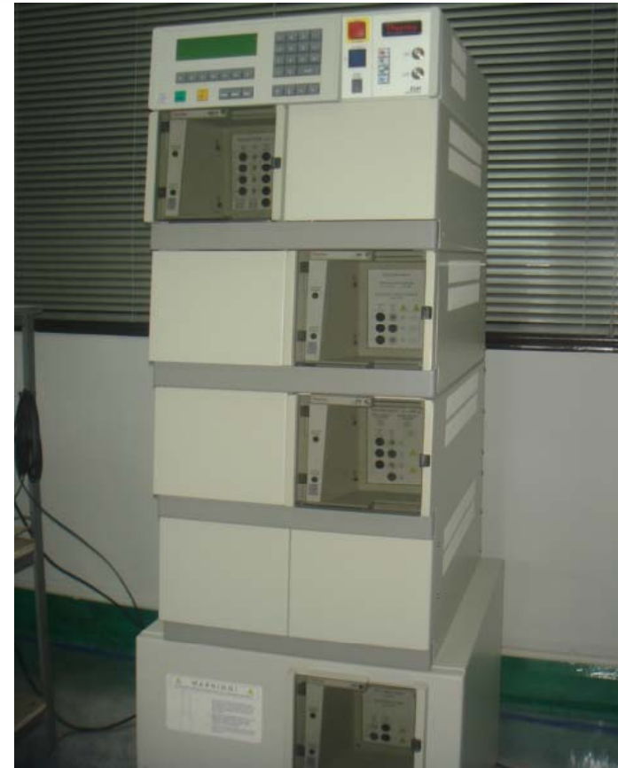
GR1089-CORE SURGE DEVICE