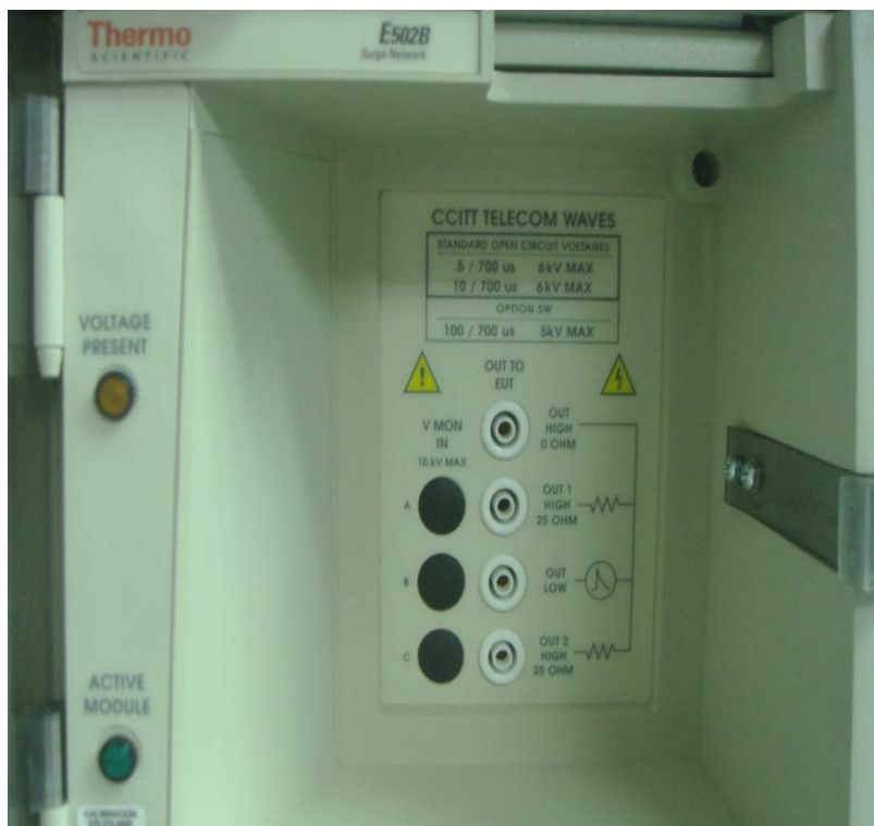
ITU/IEC 10/700 \mu s Model(1.1)