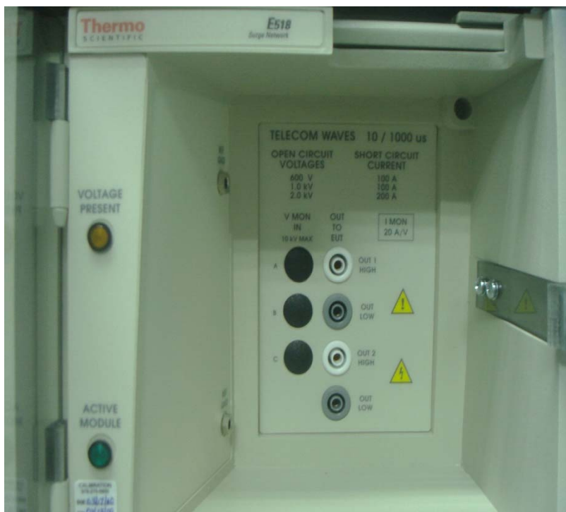
10/1000 \mu s MODEL (2.2.1)