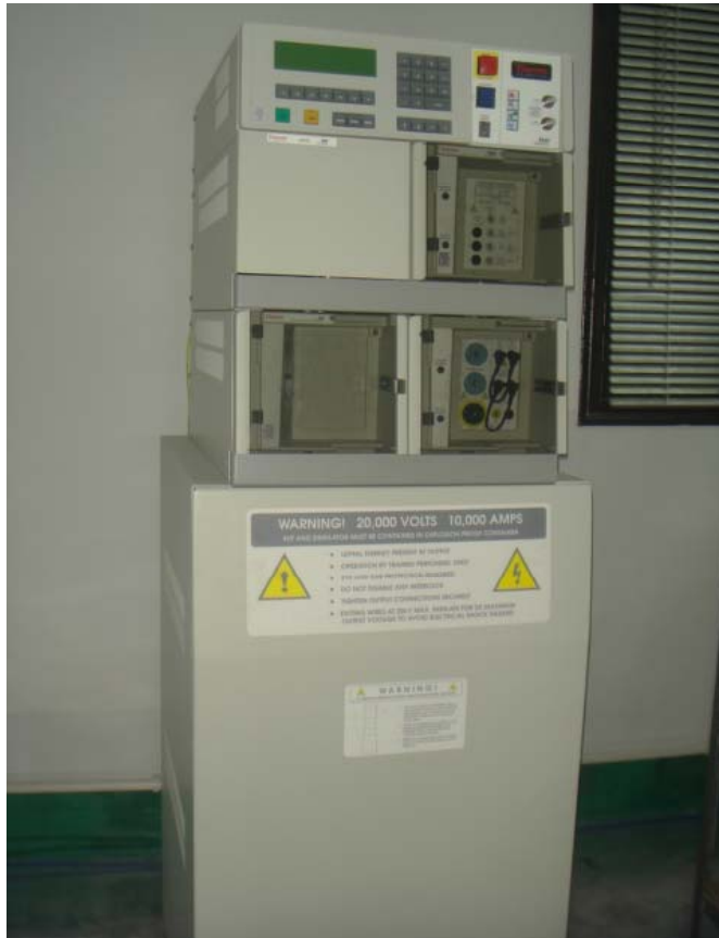
ITU/IEC/UL1449 SURGE DEVICE