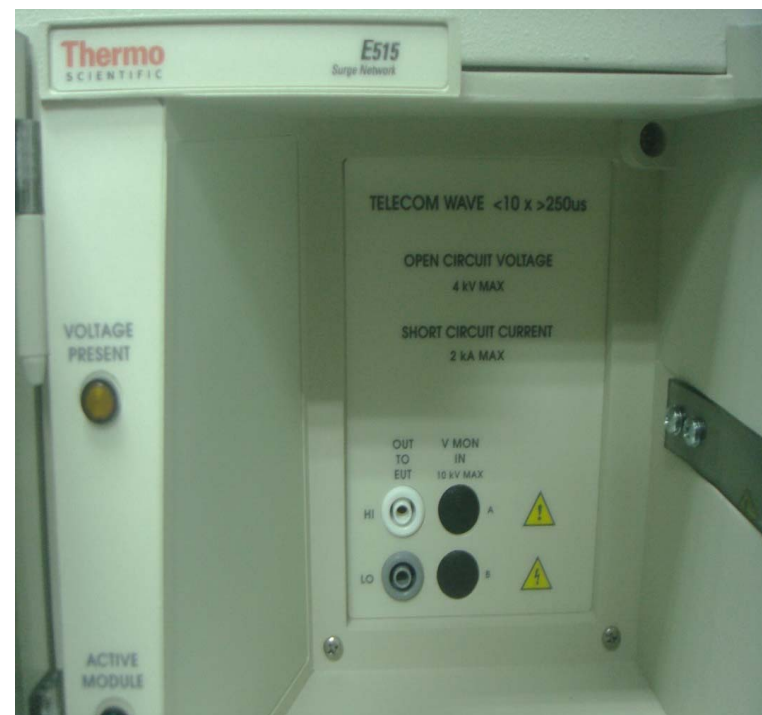
10/250 \mu s MODEL(2.2.2)