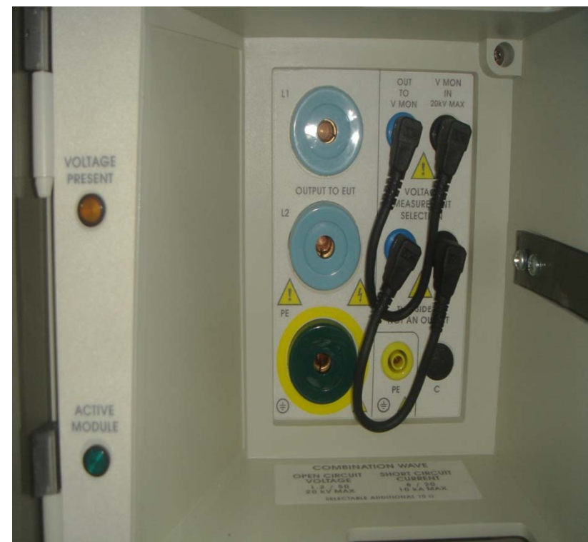
IEC 1.2/50 \mu s&8/20 \mu s Model(1.2)