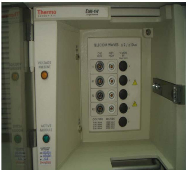
2/10 \mu s MODEL(2.1.1)