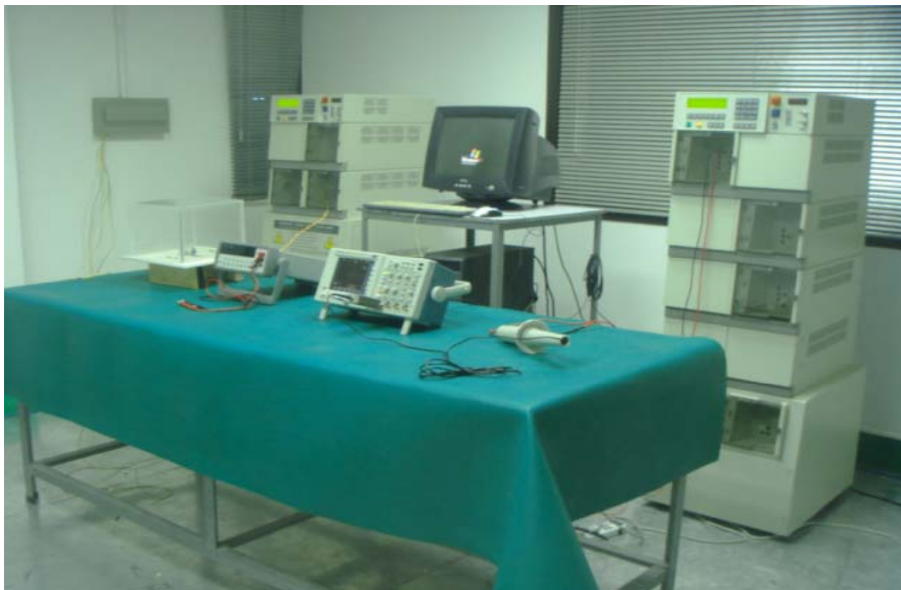
A picture of EMC Lab.